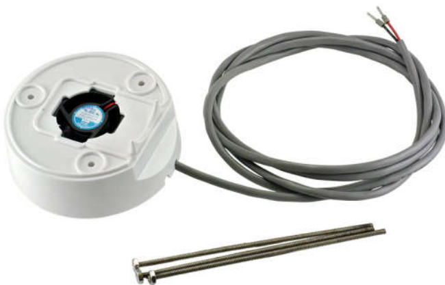
Aspirator is available as an upgrade kit.