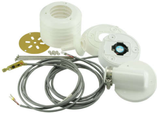
Aspirator shown with disassembled TPH-1 Sensor.

*Specifications are based upon fan manufacturer data.