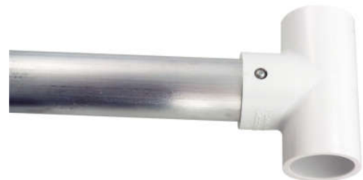
Tee on opposite end prevents reverse air flow.