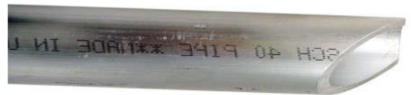
Cut mounting pipe, sensor end.