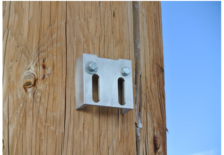
Step 1: Install top hanger.