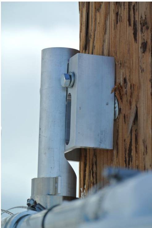
Step 3: Hang system on top bracket.