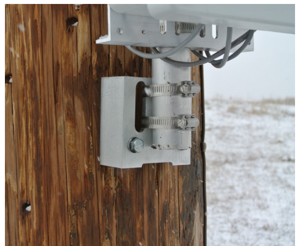
Figure 1: Step 4: Fasten bottom.