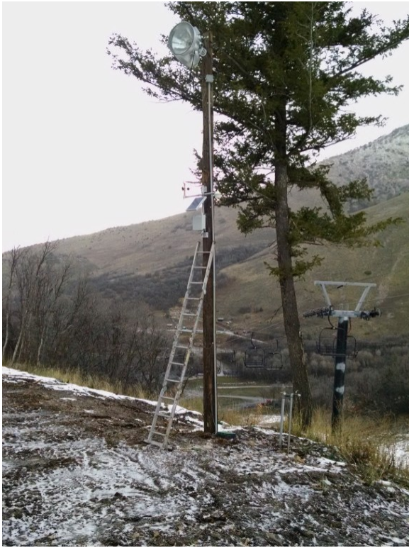
Single-person installation. (Ski hill light example.)