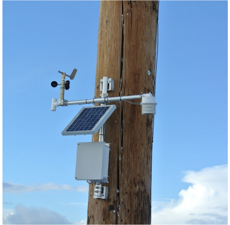
Shown with Dyacon MS-130 weather station.